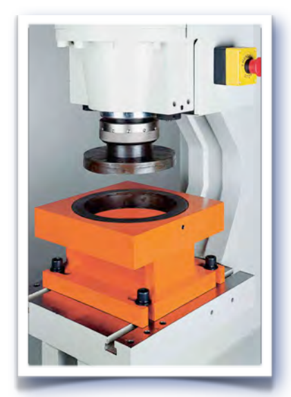
Oversize Punch Attachment

*Kit prices do not include Punches or Dies*