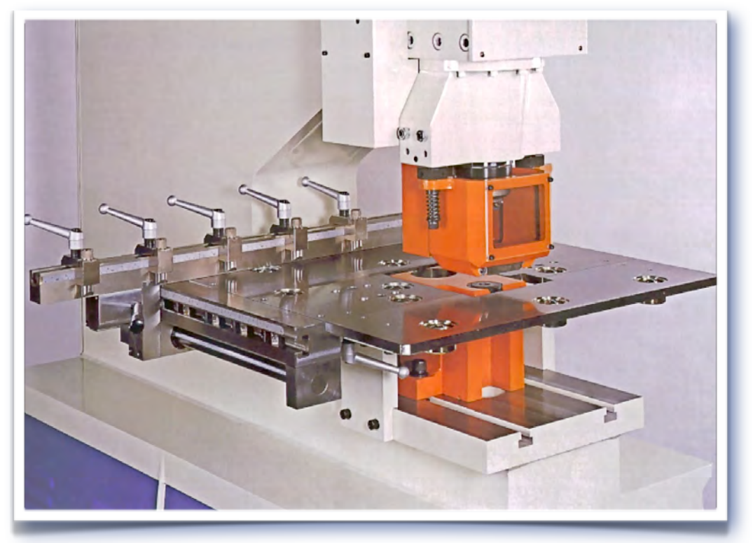
Multi-stop gauging table

Multi-stop gauge table PM -XT models up to 30" throat