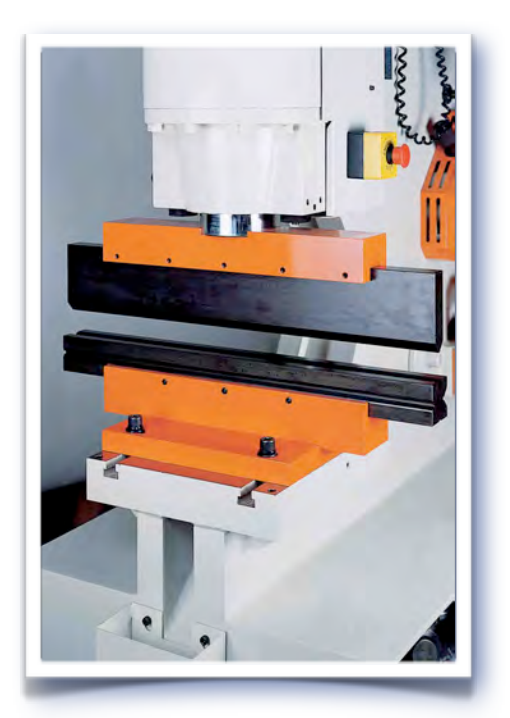
Press Brake Attachment Multi (V) 4-way lower die (3/8",7/16",5/8",15/16")