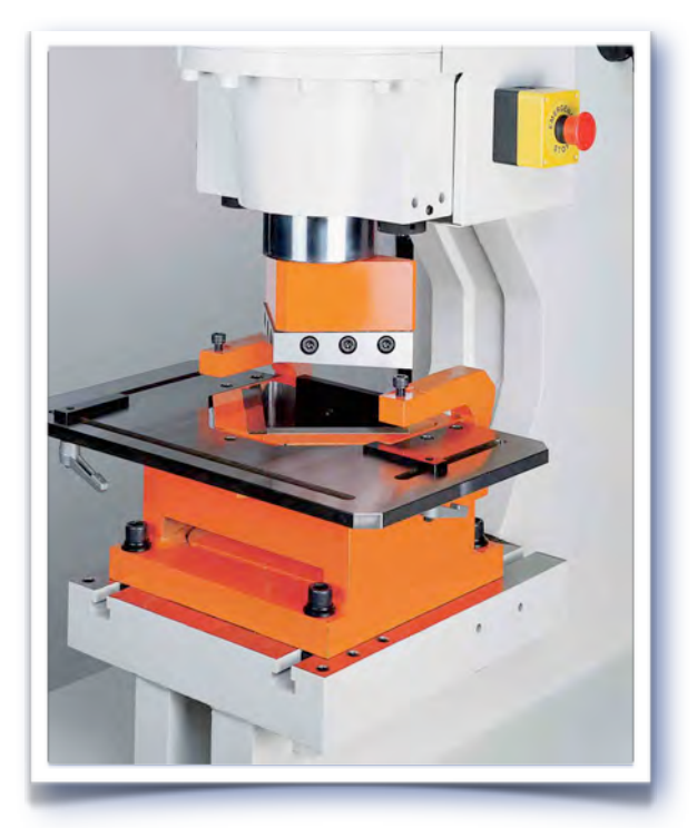
Large Triangular (V) Notcher