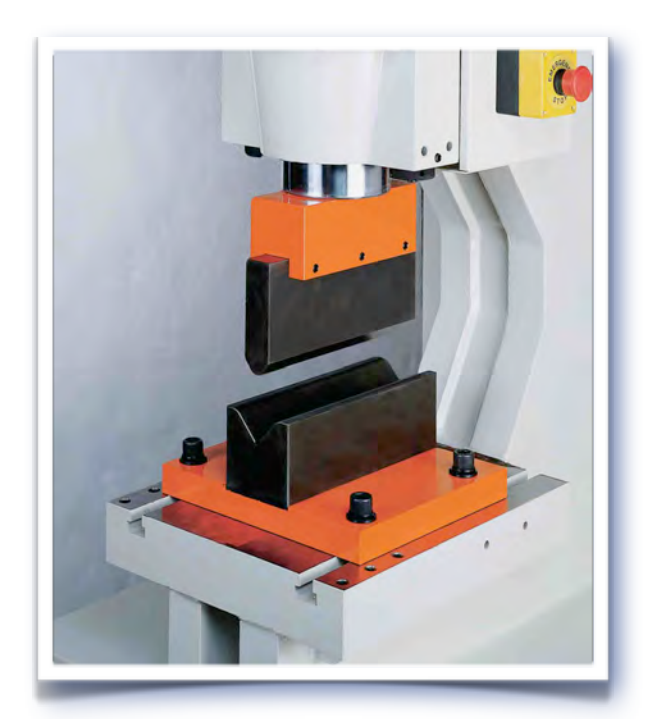
Press Brake Attachment Single (V)

*Please Note: Press brake attachments are interchangeable between all PM and IW-S/SD models*