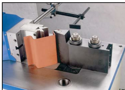
Multi-Vee Bending Tool