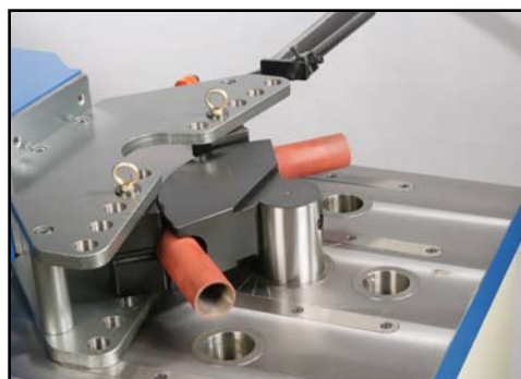
Pipe Bending Tool